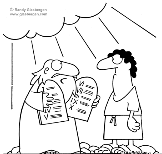
"I downloaded them from a cloud."